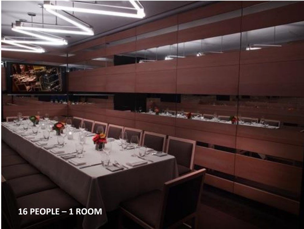
16 PEOPLE – 1 ROOM